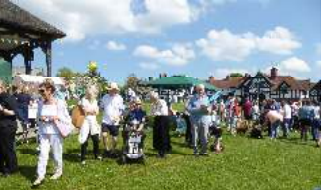
A small section of those who attended the Fete.