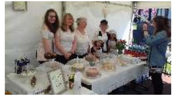
The Victorian Tea Ladies looking their best

The Wirral Symphonic Wind Band proved to be very popular playing a wide and delightful selection of music . They were enjoyed by many visitors with some sitting on the grass to follow and listen to the joyful sounds that the Band produced adding to the fun of the occasion.