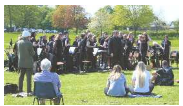
The Wirral Wind Band

Many made use of the Victoria Tea Tent with its delicious home made cakes, which did a roaring trade all afternoon as did the ice cream van. The sweet trolley was very popular with the children.