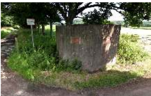
The Pill box on Storeton Lane

Here in the Parish, a few bombs were dropped as there were decoy beacons in the fields to attract the bombers. These beacons were lit at night on the "Ronsils" – ie fields behind Brooklet Farm, Brimstage and Ley Farm Barnston. Two of the cottages on Brimstage Road were damaged by bombs but not too badly and as far as I know, no one was hurt.