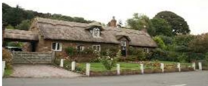
Picturesque Wirral Calendar 2018

He replied “ Easy - 3 flies were on a beer can and 2 were on the phone!! ”