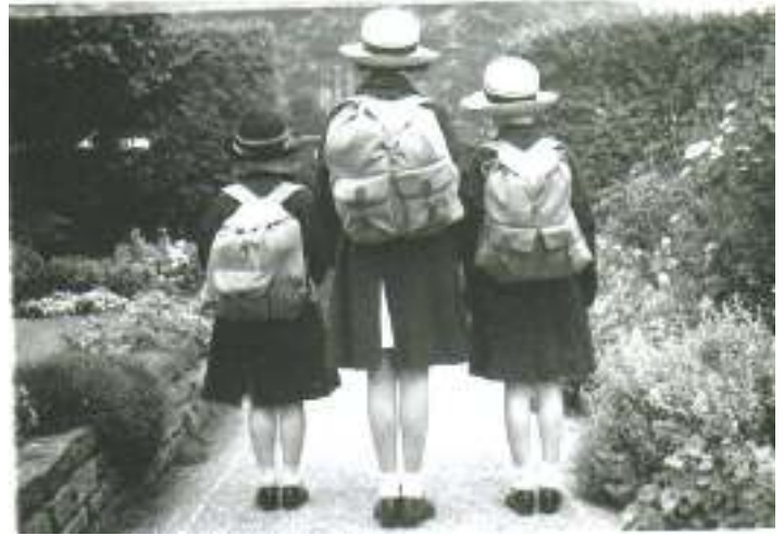
Evacuation on 4th September 1939.

My family and I were evacuated to Ruthin in North Wales in 1939. There we were, English children in a Welsh school and no understanding of the Welsh language! All the time we were in Ruthin we wondered what was happening back home on the Wirral. We could see the glow of the fire in Merseyside silhouetting the Clwydian Hills during the terrible blitz of May 1941. This was very frightening for us as young teenagers, knowing that our father and our friends were still there on Merseyside.