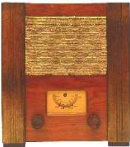
A typical war-time radio — no ear phones and had to be plugged to the electricity so it wasn't mobile. How things have changed!!

Only people like Doctors could have petrol, nothing for leisure. In those days we had to walk everywhere – no 4 x 4 to take us to school!! Also no telephone in the house and no new lines were put in during the war. We had to walk to the telephone box down the road – and that was for essential calls only so no chatting for hours!! Most people used buses for long journeys and these were few and far between. Short journeys were undertaken by bicycle or we walked!