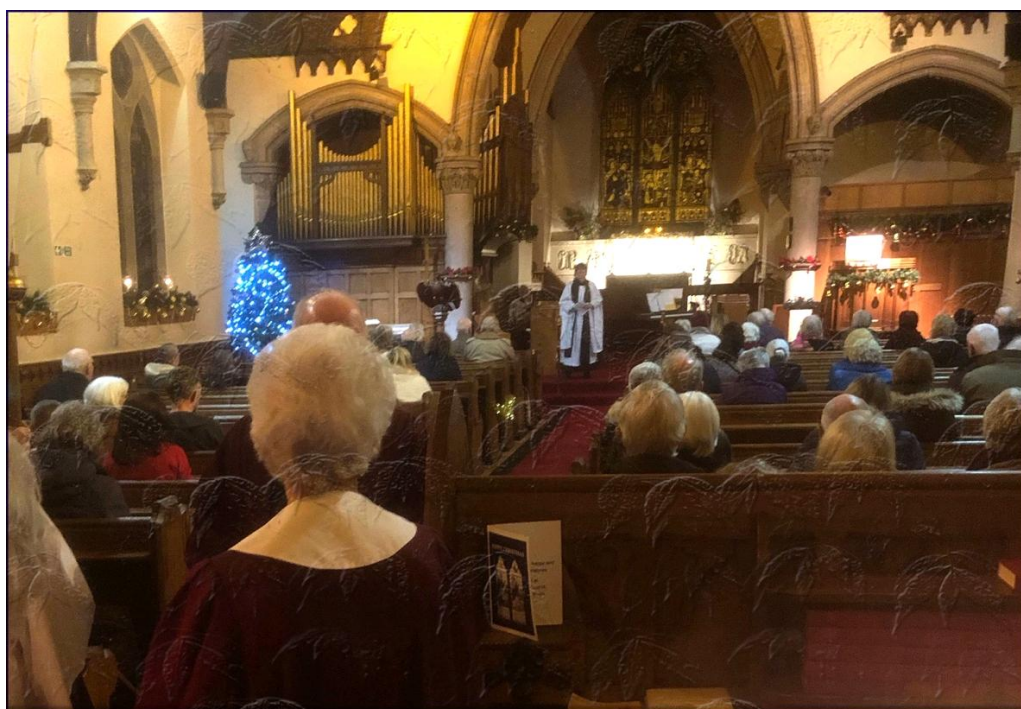
The Carol Service