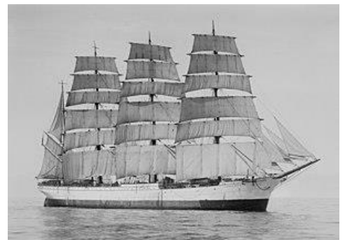
A Windjammer - his last ship