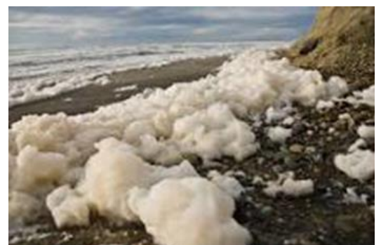
Sea froth - spume