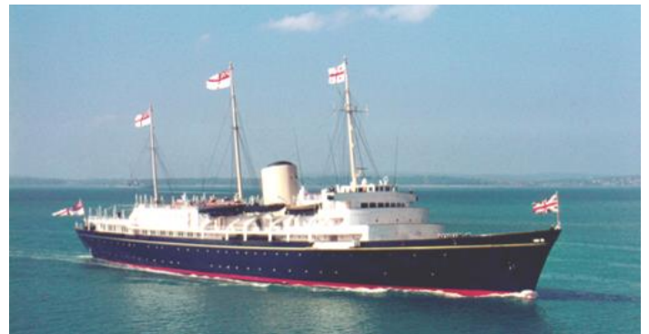
The Royal Yacht Britannia 1954 - 1997

The Queen’s turn of duty also involved a good deal of sailing, on the Royal Yacht Britannia. She put in to more that 600 ports in 135 countries, where she carried out 968 state visits. She had her honeymoon on Britannia, as did her sister, daughter and two elder sons. Hers was the only marriage that lasted.