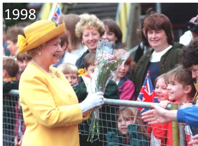
At Ellesmere Port Station on the way to open the Blue Planet Aquarium