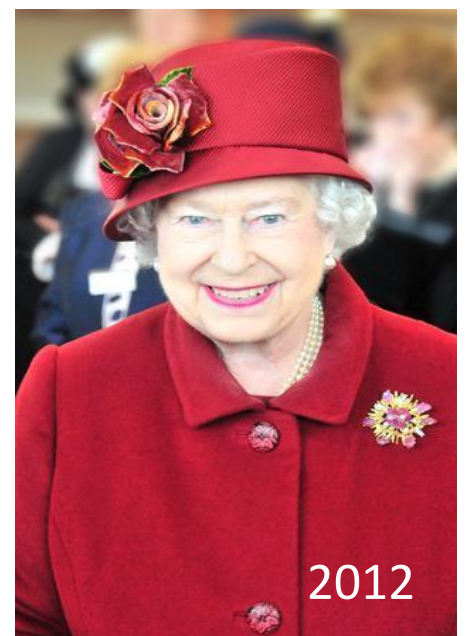
Opening the Floral Pavilion New Brighton