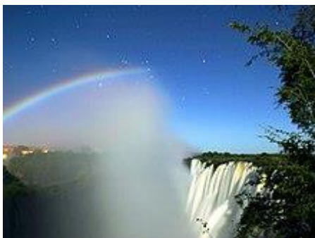
Moonbow - moon light refracted through spray