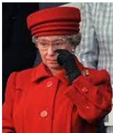
The Queen when Britannia was decommissioned