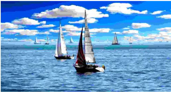
Solo sailing boats

“Trick” is the nautical term for a turn of duty at the helm (ship’s steering wheel). Queen Elizabeth, who married a sailor, has just finished her own turn of duty at the helm of The British Isles and Commonwealth. After weathering many tumultuous winds of change, along with a merry yarn, she now has quiet sleep.