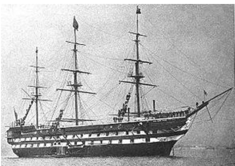
Training ship HMS Conway